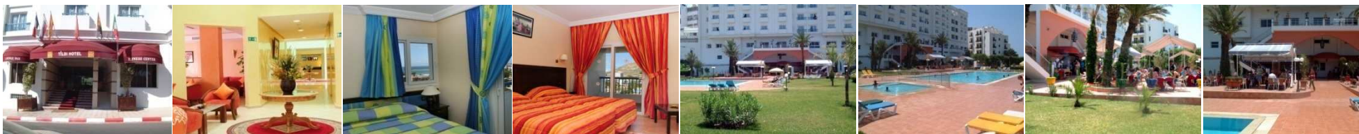
Selected pictures of Al Moggar Hotel (Package 3) Boulevard Mohamed V, Agadir 80000, Morocco http://www.hotelalmoggar.com/